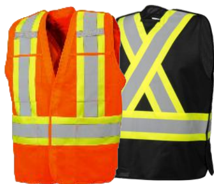
TV4 • 5pt. Tearaway Solid Traffic Vest