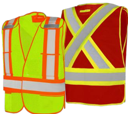
TV1 • Universal 5pt. Mesh Traffic Vest