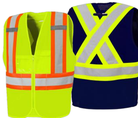
TV10 • Traffic Vest w/ Zipper