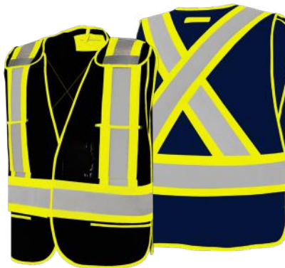
TV2 • Universal 5pt. Solid Traffic Vest