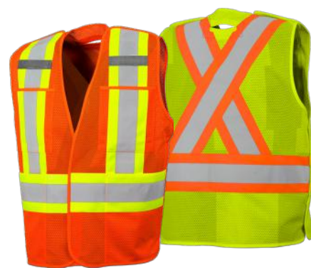
TV3 • 5pt. Tearaway Mesh Traffic Vest