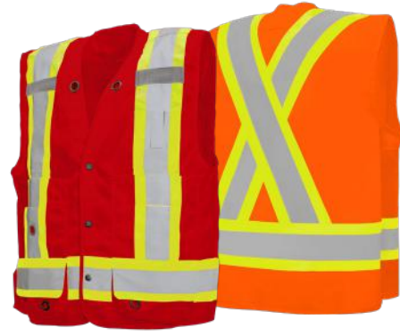
TV20 • Deluxe Surveyor Vest